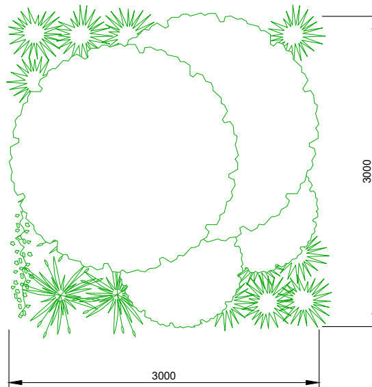
3 INDICATIVE PLANTING STYLE SCALE: 1:50